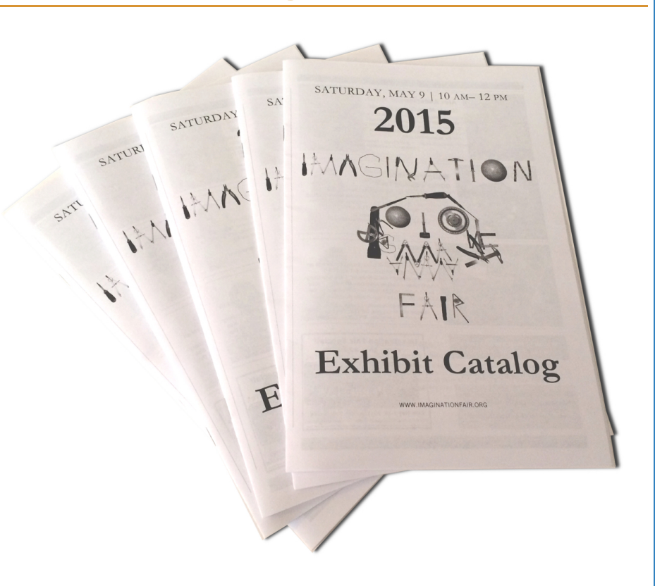
Exhibit Catalog Advertisements

All participants receive a full-color PDF version of the Exhibit Catalog to share with their friends and families.