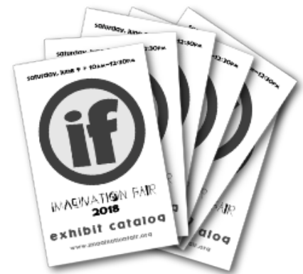
Exhibit Catalog & “Button Sticker” Info Request