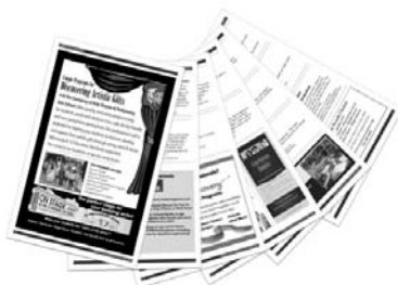
Exhibit Catalog Advertisement Mentor Discount

Mentors receive a substantial discount on Exhibit Catalog Advertisements.